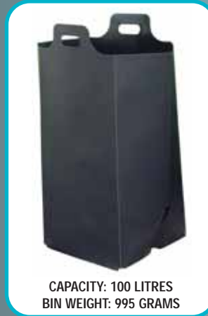
CAPACITY: 100 LITRES BIN WEIGHT: 995 GRAMS