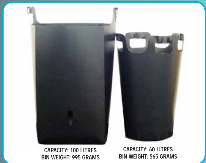
CAPACITY: 100 LITRES BIN WEIGHT: 995 GRAMS