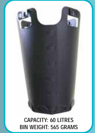
CAPACITY: 60 LITRES BIN WEIGHT: 565 GRAMS