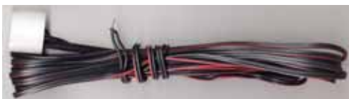
Y-2550 LEAF SENSOR