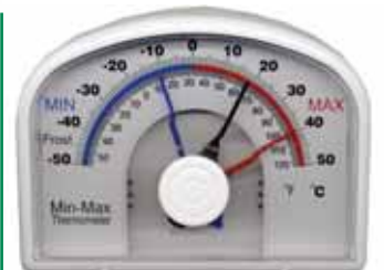
S-2120 THERMOMETER DIAL MAX/MIN