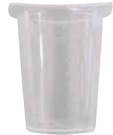
S-3868 GRO-MAX MEASURING CUP 100ML