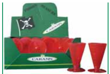
S-2150 JOLLY ROGER POISON MEASURE 24 PACK