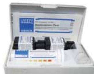
S-0017 SITEST AMMONIUM TEST KIT