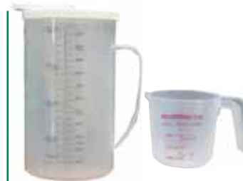
S-2215 MEASURING JUG 1LT S-2210 MEASURING JUG 250MM